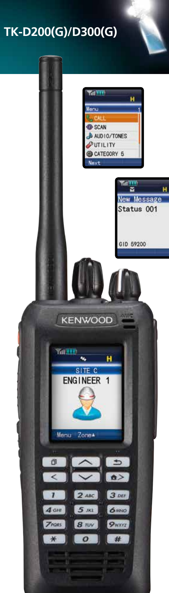
Actual size TK-D200(G)/D300(G)