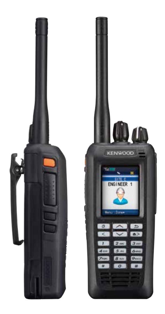
TK-D200(G)/D300(G) Display model