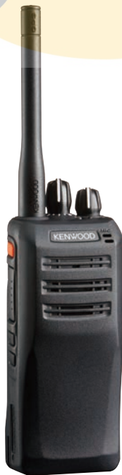
TK-D200(G)/D300(G) Non-keypad, non-Display model

After powering up the TK-D200(G)/D300(G) or changing the battery, the radio is ready in a few seconds, enabling a rapid user response. Similarly fast is the GPS Time To First Fix, taking just 10 seconds (hot start), or less than a minute from a cold start.