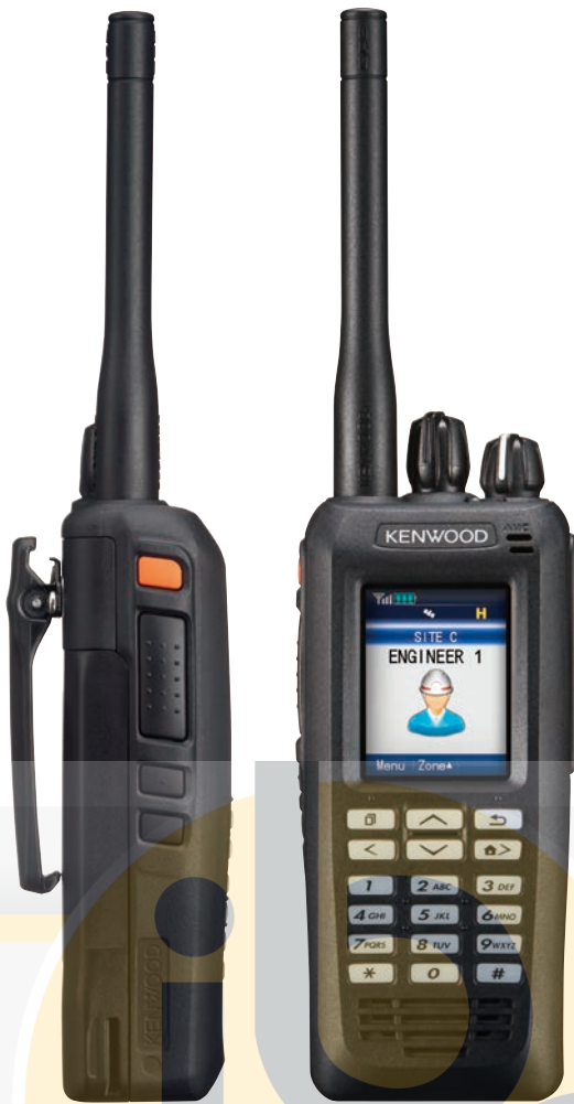
TK-D200(G)/D300(G) Display model

JVCENWOOD has drawn on decades of expertise in audio equipment development to ensure that the sound quality of the new TK-D200(G)/D300(G) is clear and crisp, as well as loud. The AMBE+2™ VOCODER technology accurately replicates natural human speech nuances for superior voice quality, even with high levels of ambient noise. Additionally, Voice Announcement can read out the received channel number to inform the user of channel changes, so there is no need to look at the display.