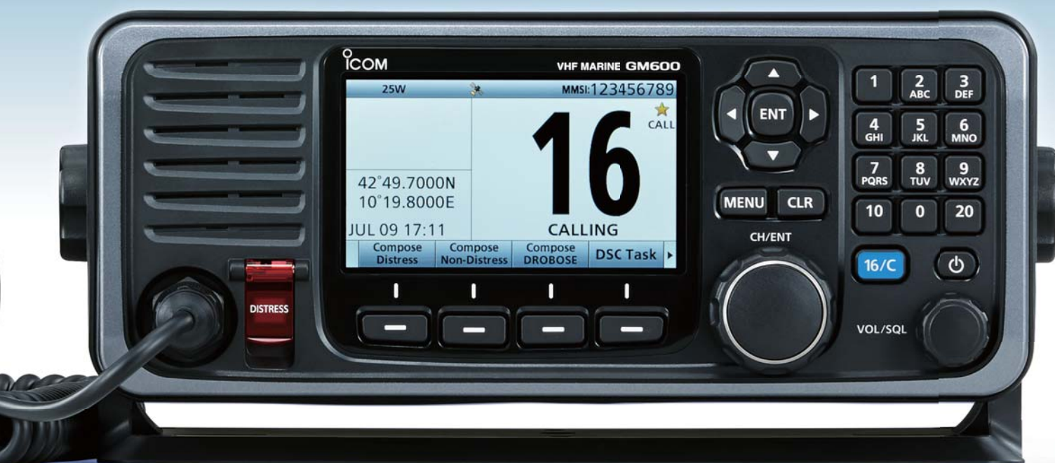
Day mode display