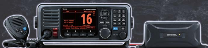
Night mode display