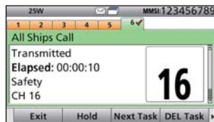
DSC Multi-task screen

The GM600 has a dedicated DSC receiver which continuously monitors CH 70 and is independent of the main receiver and other operation. The DSC Multi-task function allows you to show up to 7 received and transmitted DSC messages. While using the DSC Multi-task screen, the operating channel is shown at the right side of the screen.