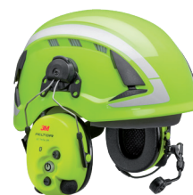
MT15H7P3EWS6 / MT15H7P3EWS6-111