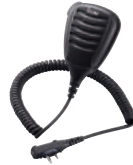
HM-168LWP IP67 waterproof speaker-microphone