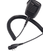
HM-159LA Full size durable speaker-microphone

HS-97 : Throat Microphone with earphone. VS-4LA or OPC-2004LA is required. VS-4LA: PTT switch cable for manual PTT operation OPC-2004LA: Plug adapter cable for VOX hands-free operation HS-94 and HS-95 also can be used with either VS-4LA or OPC-2004LA.