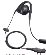
HS-94LWP Earhook headset with boom microphone and waterproof connector