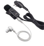
HM-153LA Lapel type microphone with earphone