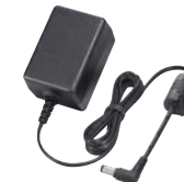
AC adapter BC-242