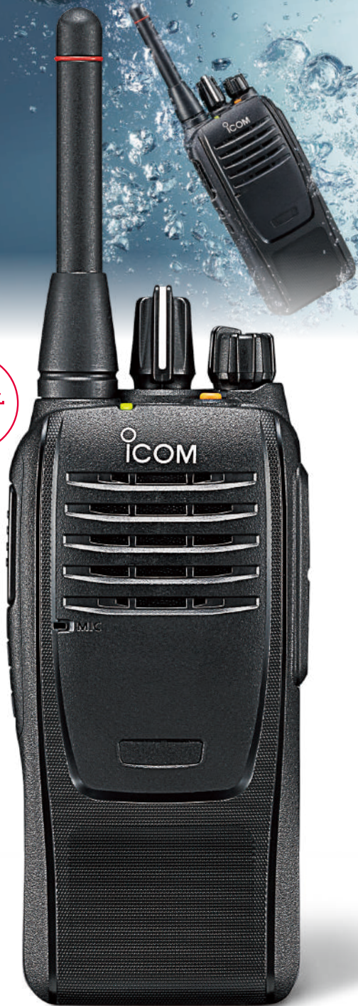
dPMR™ 446/PMR446 TRANSCEIVER IC-F29DR3