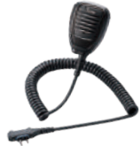
HM-222HLWP waterproof speaker-microphone