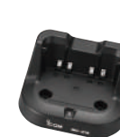
Rapid charger BC-213