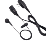
HM-166LA Light weight earphone microphone