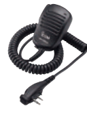
HM-158LA Compact size speaker-microphone