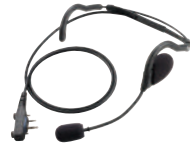
HS-95LWP Behind-the-head type with boom microphone and waterproof connector