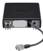
Optional OPC-1939 installation image