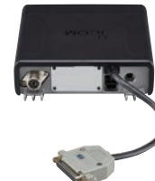
Optional OPC-2078 installation image