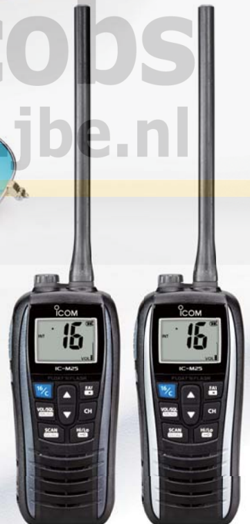
● Metallic Gray