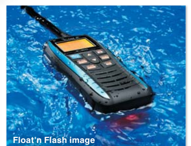
Float'n Flash image