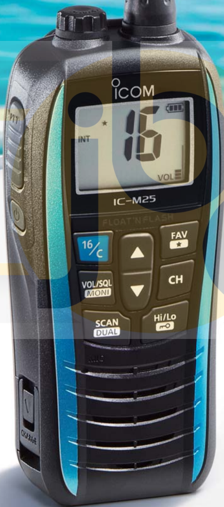
● Marine Blue